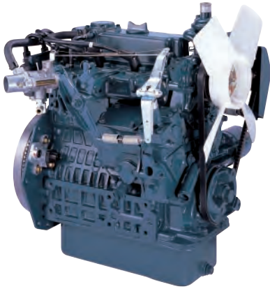
Photograph may show non-standard equipment.