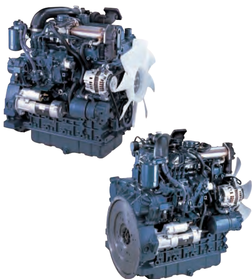
Photographs may show non-standard equipment.