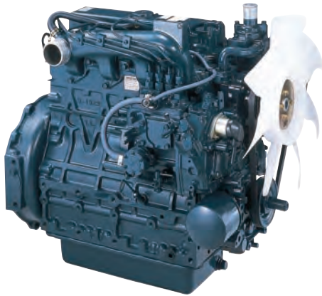
Photograph may show non-standard equipment.